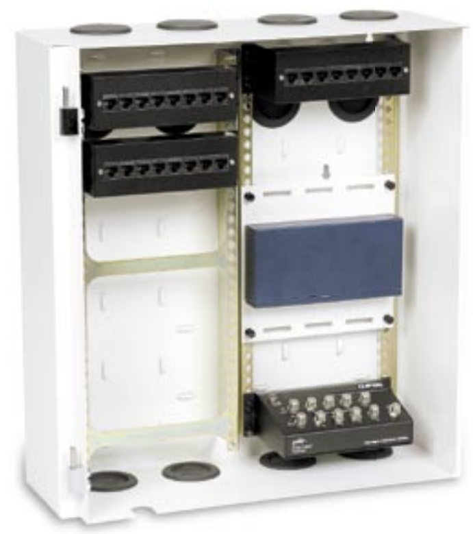
StarServe Home Office: Three video sources capable of infra-red control (VCR, Pay TV, DVD or Free to Air), a Data network and telephone services