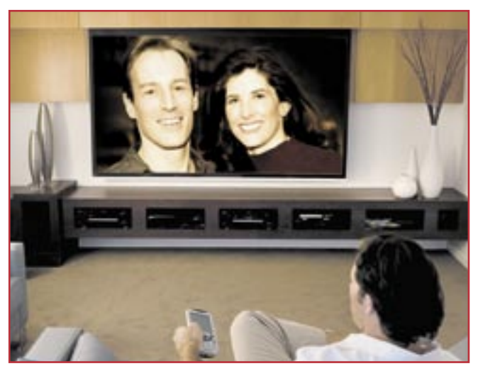
See who's at the front door without leaving your chair