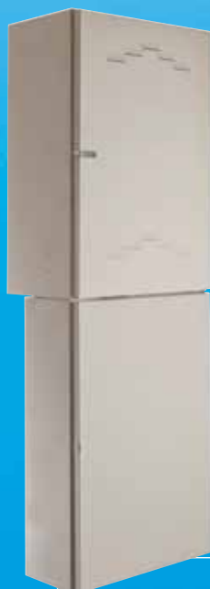
230DRA Series Meter Box

This HDU is not suitable for mounting wireless equipment.